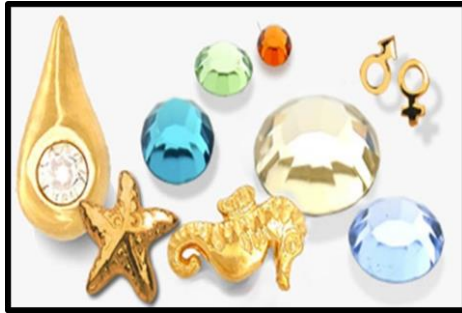
Fig. 3: Design of tooth jewellery selected