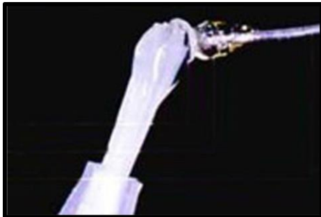
Fig. 5: Skyce Vivadent adhesive material probe