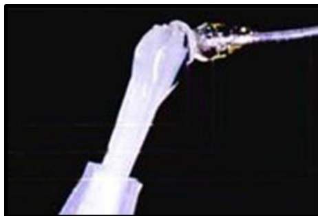
Fig. 7: ! Here is the result!!

combination of precious stones and gold. A center piece is inlaid into a gold setting, which is fashioned like a stud. The gold is genuine and may either be the familiar yellow metal or the more subtle white alloy. [4,5] The center stone may range from actual diamond to sparkling glass. A lot of consumers opt to use this teeth jewellery for some reason, it is semi-permanent, it is user friendly, it is fabulous, and it is relatively inexpensive. Dental jewellery are made to become semi-permanent jewellerys that its owners can easily remove if they would want it.