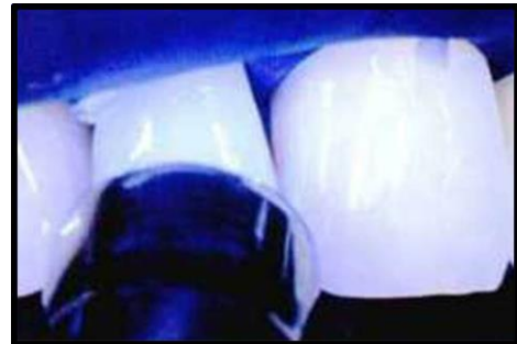
Fig. 6: Light curing is done on all sides

This separate it from piercing and tattoos because, it is painless, safer and easier to maintain. Vivadent has developed the Skyce system of tooth jewellery, which enables dentists to satisfy this cosmetic demand according to dental requirements. Skyce is a range of crystal glass tooth jewellery. The stones are bonded to the labial surfaces of natural upper anterior teeth without invasive preparation, easy to apply. Skyce jewels are applied to the labial surfaces of upper anterior teeth. The crystal glass stones are available in two different colours and sizes: 1.9 mm diameter or 2.4 mm diameter; crystal clear or sapphire blue. The contact surface of the tooth must be professionally cleaned with brushes or cups and polishing paste, e.g. Proxylt. First a retentive pattern (microtags) is produced by etching the enamel using 37% phosphoric acid. The diameter of the etched surface must be slightly larger than that of the stone. Then, the Skyce is placed onto the etched tooth surface and bonded to the tooth using the transparent, flowable Heliobond.