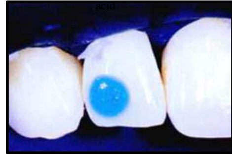
Fig. 4: Heliobond is applied to the Skyce